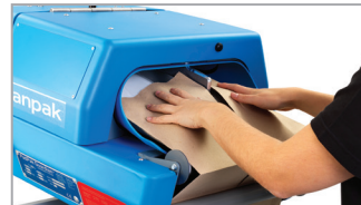
Paper loads with the push of a button