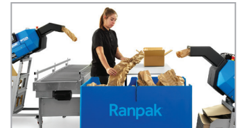
Fits into cramped lines where space is tight