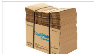
Compact stacks of paper are easy to handle