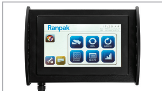
Detachable 7" touchscreen